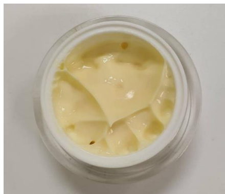
Figure 3. Cream with 6%w/w MGS-1 showing the cream texture.